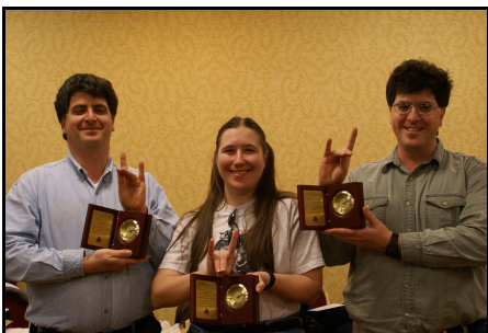
Thugs, alleged, now with extra spelling

This year's honorees, working as a team, have aided Norwescon through countless hours of hard work, heavy lifting, and the willingness to go the extra mile to assure that everyone behind the scenes – as well as every person who attends the Convention – always has all the “stuff” they need.